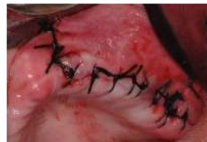
Closure of the incision