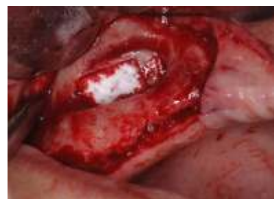
Sealing the perforation with the use of the Collagen dressing Hemospon Tape