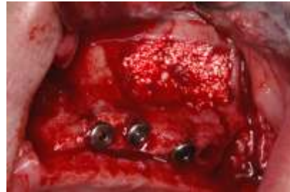
Placing the biomaterial with PRP, bone filling the cavity