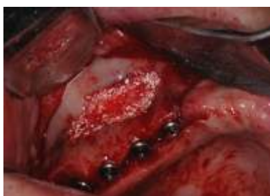
Filling of the bone cavity with graft material. There was no leakage of biomaterial into the Schneiderian membrane