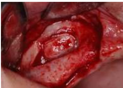
Bone cavity presenting small perforation of the Schneiderian membrane