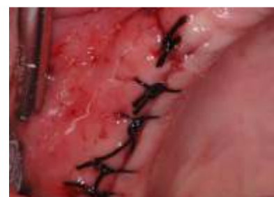
Closure of the incision