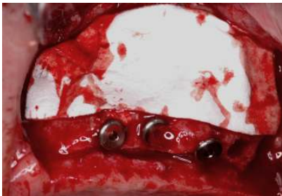
Contention and protection of the graft material with the Collagen dressing Hemospon Tape